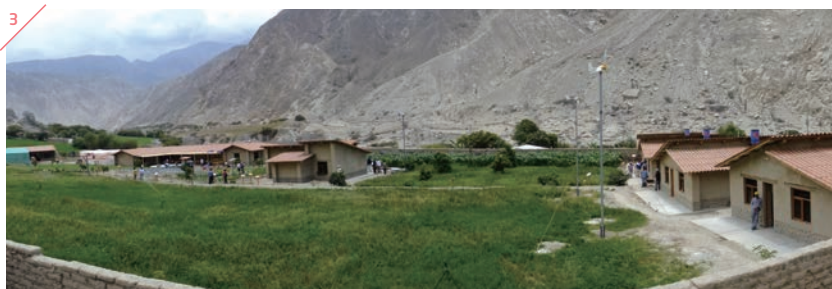
3 View of the Yachaywasi branch

Peru is an invaluable treasure of unlimited possibilities for SK innovation to realize its vision of global resource development projects. But with many poor farmers who are living hand to mouth, and under the belief that we should give back to society for global expansion opportunities, SK innovation has consistently worked on independent social enterprise projects. Its CSR activities in Peru began in 2007, when it set up an NGO called SK-Prosynergy as the control tower for its local CSR activities in response to the Peruvian government's invitation to its farming village development project. As of January 2012, we upgraded our CSR activities and initiated social enterprise programs such as the My School and My Eco-Tech Farm programs.