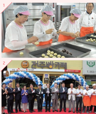
1 - 2 Social Economy Development and Support program, Jeonju Bread café opened in front of the Jeonju City Hall in July 2014.

In partnership with the Community Chest of Korea and the Korean Association of Community Seniors' Clubs, SK innovation advertised for a Social Economy Development and Support program in 2013. Through paper screening and due diligence with a total of 65 proposals submitted to this first such program arranged by a Korean conglomerate, we supported four select business proposals to establish social enterprises, community businesses or social cooperatives, creating jobs for older citizens in Seoul, Daegu, Jeonju and Yeongkwang. SK innovation also contributed business consulting services in accounting and labor issues as well as budget subsidies.