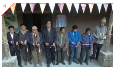
3 Construction site of Yachaywasi 4 Opening of the second Yachaywasi branch