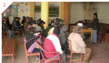
1 Opening of the first Yachaywasi branch 2 Agricultural technique education program