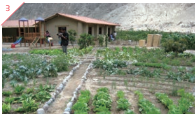
1 · 2 Presentation on the Parent Monitoring System 3 View of the Yachaywasi farm